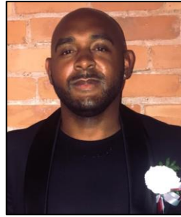
Princeton Bryson Certification