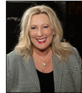
Denise Dahl Foundation