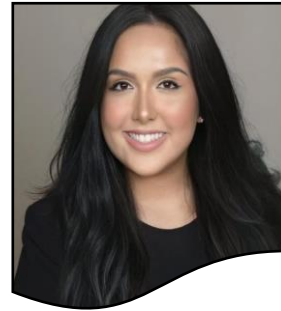
Virginia Diaz Communications